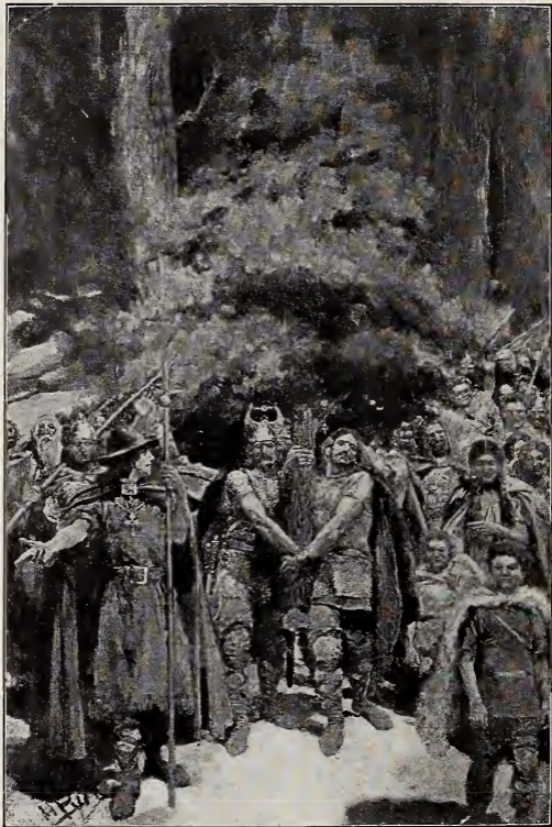
SO THEY TOOK THE LITTLE FIR FROM ITS PLACE